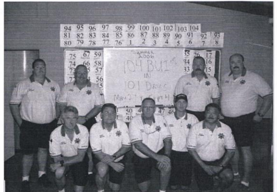
San Joaquin County Sheriff's Office Boating Safety Unit members